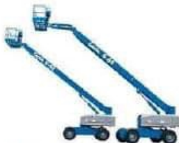
Self Propelled Aerial Work Platforms