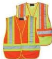
High Visibility Vests