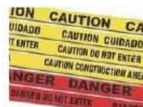
Hazard Identification Tape