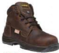
CSA Approved Footwear